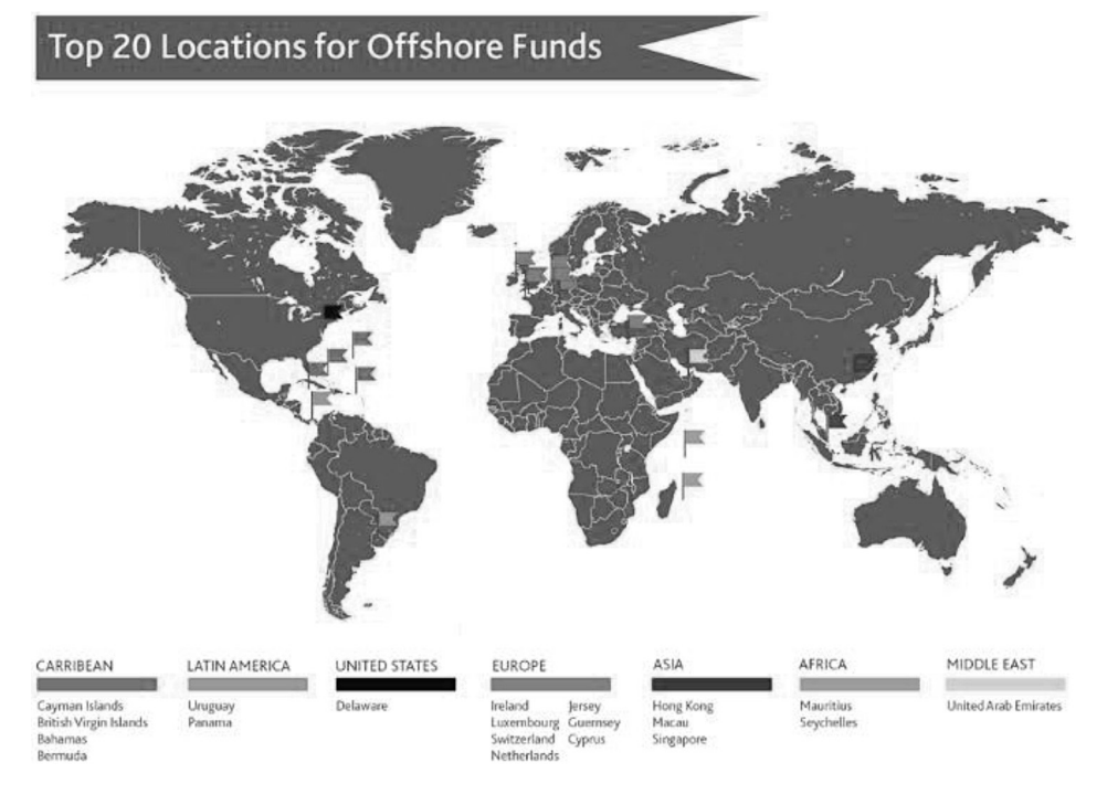
Figure 2. Countries, territories and jurisdictions with offshore financial centers